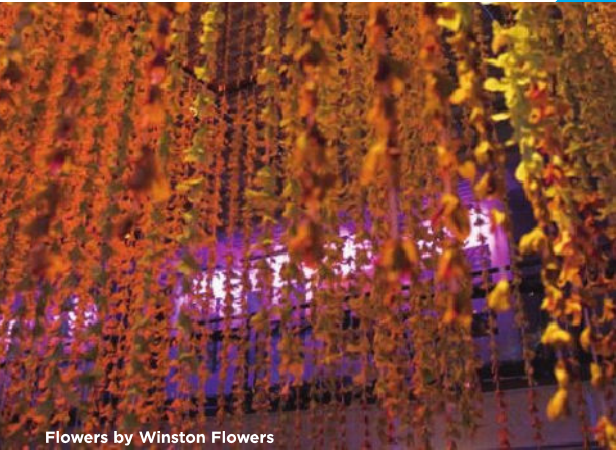
Flowers by Winston Flowers

Awards Ceremony on June 10 Artists for Humanity EpiCenter