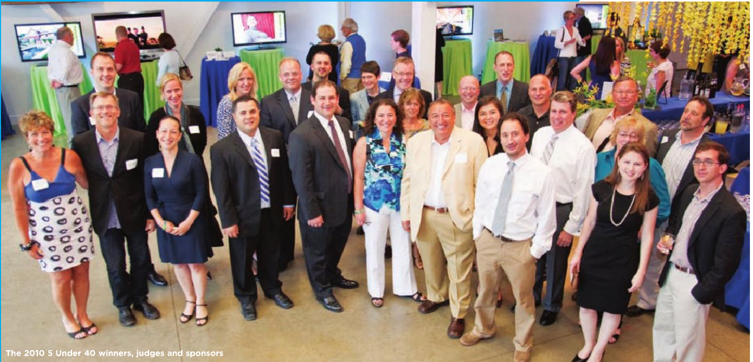
The 2010 5 Under 40 winners, judges and sponsors